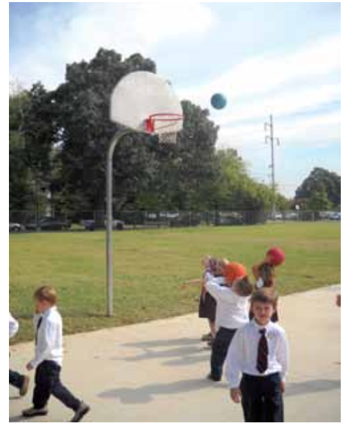
A new basketball court, located on the playground, was a gift from the Strong and Hagler families.