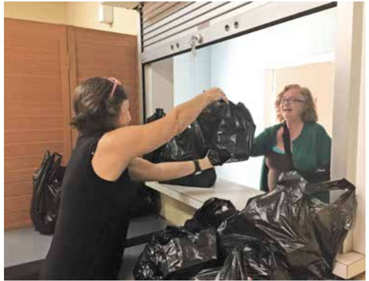
Every afternoon, CSS staff members pack and prepare bags of food that will be given out on the following day.

There are clients with all sorts of problems who walk through those front doors, but for the little while they are in there, they experience a calm and orderliness that provides a respite from their own lives. In addition to the coffee and snacks that are available to them, the staff and volunteers offer them respect, kindness and empathy. Of course, not every problem